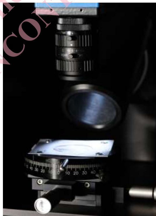
Fig. 2: Quantirides® system

The crow's feet area was previously found to be the major site of wrinkles in Asian skin [15] and skin replicas analysis, which is commonly used in anti-wrinkle studies, was previously taken as the method to study changes in skin micro-relief and wrinkles with increasing age [16]. It seemed therefore relevant to assess wrinkles of the crow's feet area for this study. Parameters such as number, length and depth of wrinkles were analyzed. This method was associated with subjective evaluation from the subjects who were asked to answer self-assessment questionnaires following products application. A set of 13 questions was asked to subjects after 1 and 2 months of products application for each treated half-face. Seven questions were related to the evaluation of product efficacy (anti-wrinkle, anti-ageing, improvement of eye contour appearance) while